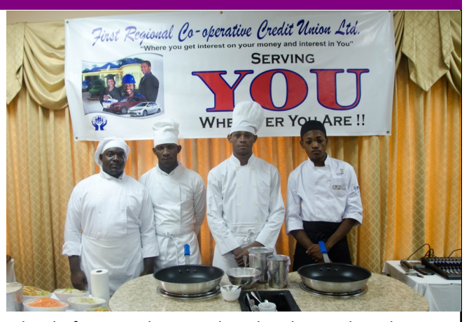
The chefs get ready to conduct their live cooking demonstration of preparing various meals